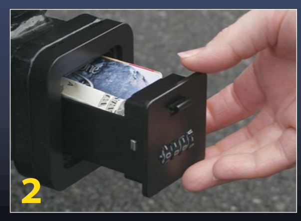
Retrieve keys, cash, credit cards or driver's license