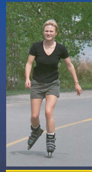
ced out! keys to e, home, ocure our keys