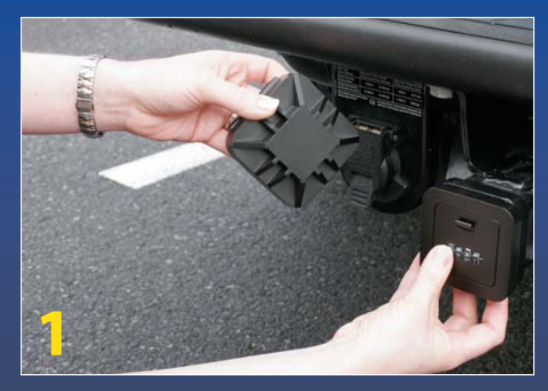
Remove the dust cover and input your personal 4 digit combination